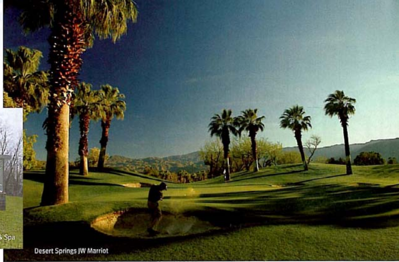
Desert Springs JW Marriot