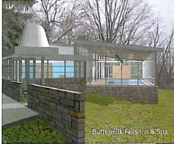
Buttermilk Falls Inn & Spa